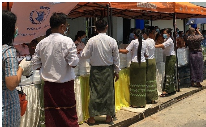
WFP distributing meal boxes to returning migrants near Myawaddy, Kayin State.

UNHCR continues providing assistance in Kayin, Kayah, Kachin and Shan states, and is providing technical assistance to the Kayin State Government and NGO, Local Resource Centre (LRC), to develop an interactive geographic information system (GIS) interface aiming to map existing and planned quarantine facilities to support future interventions. Seven sites of community-based and/or IDP camp-based quarantine facilities have also reportedly been setup and managed by Camp Management Committees, and are being offered technical support to assess conditions and needs. Activities in Kachin include a protection assessment on the conditions of seven quarantine facilities in Bhamo, Myitkyina, and Hpakant (persons and returnees quarantined in these sites voiced a need for hygiene and NFI kits; access to food; lighting for toilets and bathrooms; and better accessibility for persons with disabilities), as well as the building of laundry areas in quarantine facilities in Myitkyina. UNHCR also distributed NFI (50 mosquito nets, blankets and sleeping mats) to a quarantine facility in Lashio, Shan State.