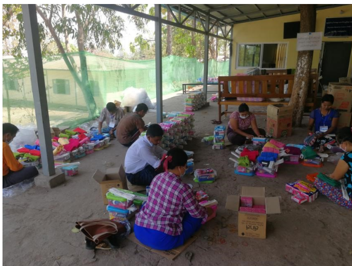
Distribution of WASH kits at a community-based facility quarantine centre near Myawaddy, Kayin State.

of China and through the Lweje border gate, according to data from the Kachin State Government (695 internal migrants also returned from other states and regions of Myanmar). Returnees are being transported to Myitkyina, and from there, to their communities of origin where they will stay in community-based facility quarantine centres.