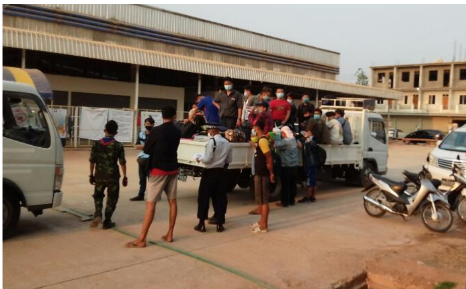
Migrants preparing to return to their communities of origin following 21 days of quarantine at Myawaddy, Kayin State.

mainly from the People's Republic of China