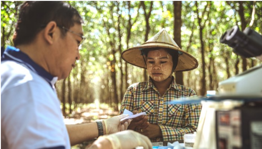
IOM Lab Technician is preparing slide for malaria testing to migrant worker at rubber plantation in Mon State.