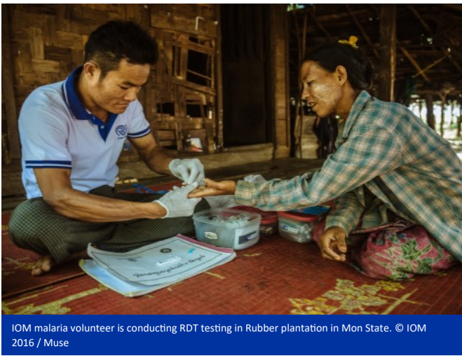
IOM malaria volunteer is conducting RDT testing in Rubber plantation in Mon State.