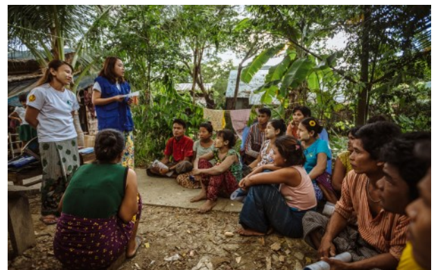
IOM Community Health Supervisor (CHS) is giving Health Education Session to migrants in

IOM Myanmar also strives for the enhancement of quality data collection and reporting including health management information systems and data quality assurance and through conducting assessments of service accessibility in targeted communities.